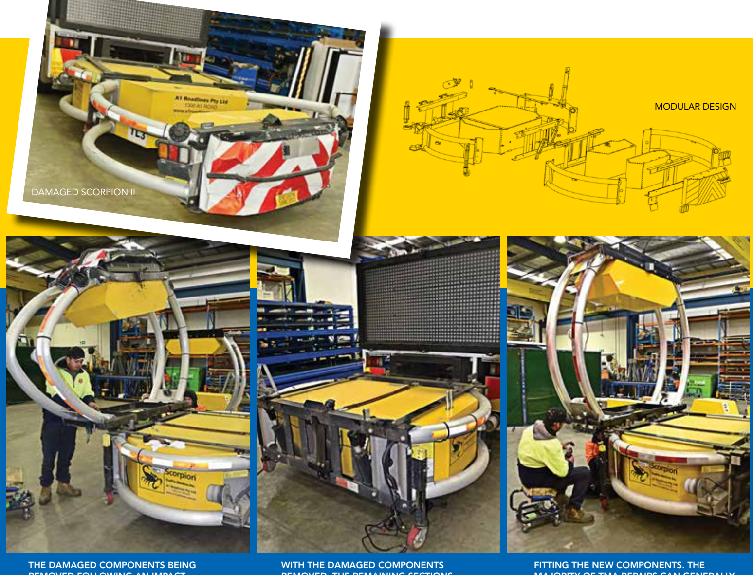
REMOVED FOLLOWING AN IMPACT.

The Scorpion II TMA units are extremely quick and easy to repair, and with the greater majority of repairs coming in at only a fraction of the cost of a replacement unit, they deliver outstanding 'whole of life' value.